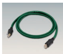
HS-LINK Cable AHDL-15